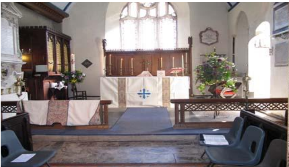
Internal view of Diptford Church.

St. Mary's Church, North Huish, which was closed in 1993, is managed by Churches Conservation Trust which maintains the building. An active local group cleans and decorates the church for the three services a year which are held there: the beautiful country location is a perfect setting for the Rogation Service, a large congregation attend the Remembrance on 11th November at 11.00 o'clock and the candlelit Carol Service with about 150 attending (many staying afterwards to enjoy a homemade supper).