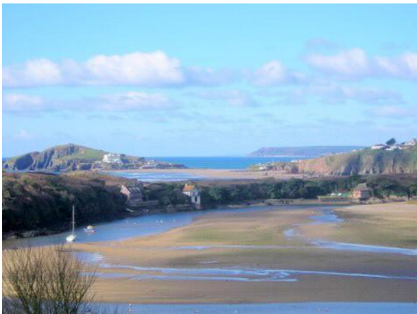
The mouth of the River Avon at Bantham

TRMC comprises two benefices; the United Benefice of Diptford etc and the United Benefice of Ermington and Ugborough. TRMC had a Rector who served the wider area of the Diptford benefice for 12 years which was then extended five years ago to include the United Benefice of Ermington and Ugborough. The latter benefice has quite recently been made part of the Totnes Deanery.