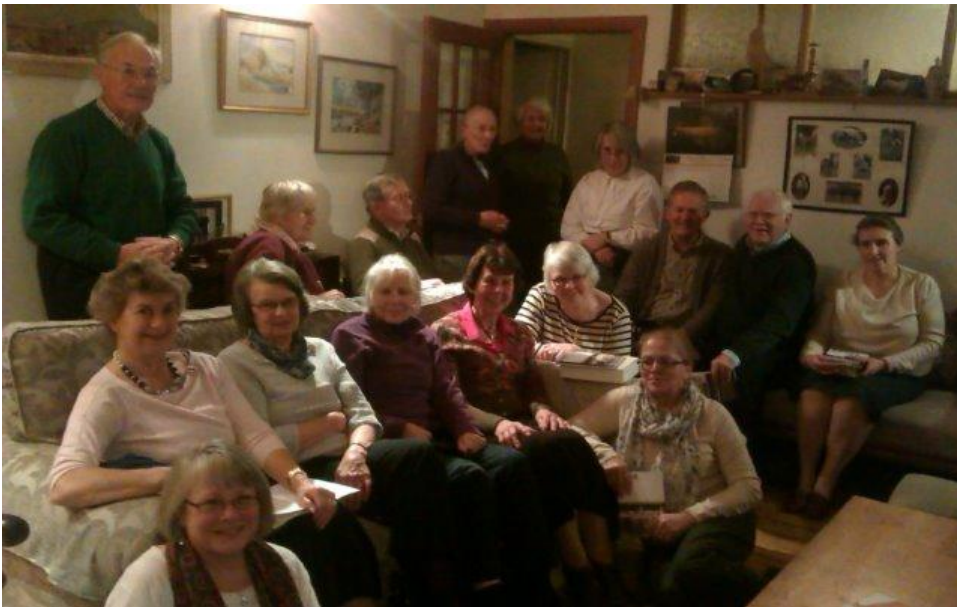
A fortnightly Emmaus bible study where all parishes get together.

With regard to finances , our turnover for 2013 was £32,000, the majority of which was donations. Our expenses are always hampered by the inevitable building costs which are very onerous. Last year our total expenses amounted to £35,000. Despite this we always pay our Common Fund in full – and last year contributed over £1,900 to charities. We currently have approximately £23k in bank accounts.