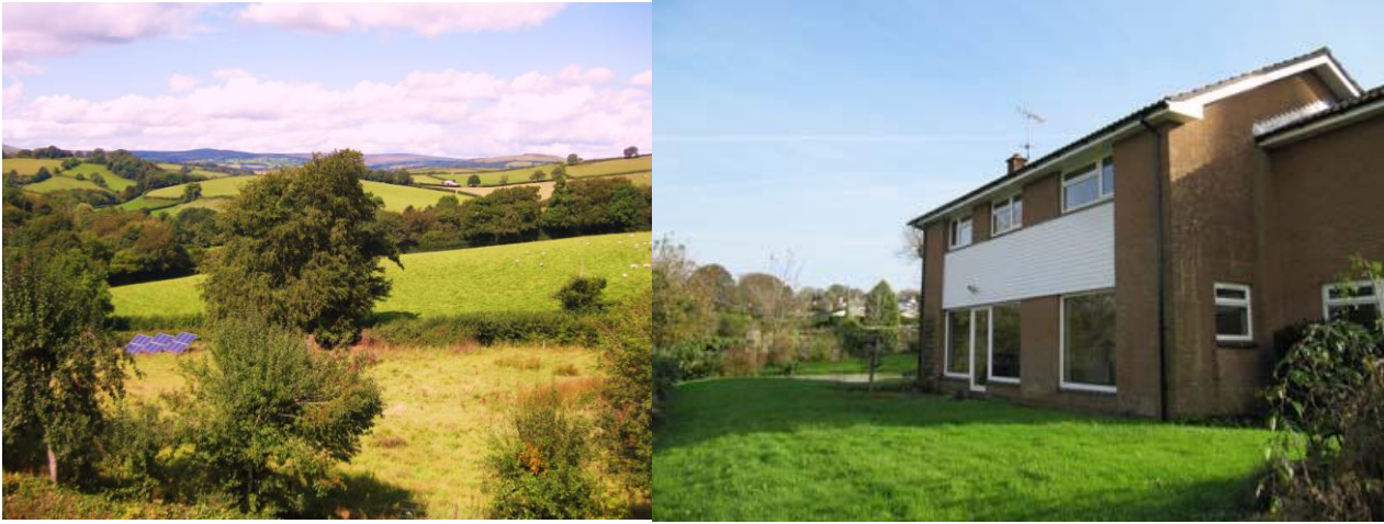
View from the Rectory towards Dartmoor.

The Rectory was built in 1970 close to the centre of Diptford just off the main road into the village. It has wonderful views of Dartmoor, and is about a 2minute walk from the church and primary school. The centrally heated house offers excellent family accommodation with four bedrooms, and two reception rooms of good proportions together with a downstairs office. The gardens are private and manageable and there is parking space and a garage.