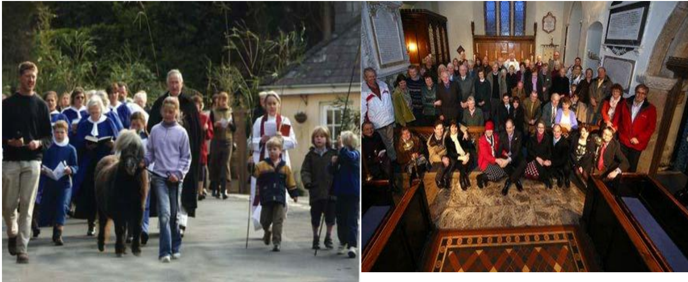
Diptford Church events.

As for finance, we have three major fund raising events. The busy spring Plant Sale is held in a different person's garden each year. The stalls sell plants from experienced gardeners as well as 'home grown' seedlings and cuttings. Gift Day, which encourages people to drop by with a gift and stay for a chat works smoothly; helpers feel it is good that 'the church' is seen in the heart of the village. The Village Fete, held at Diptford Court, has children's races, dog races and all the usual stalls as well as cream teas and a BBQ. Everyone always seems to have a great afternoon particularly when the sun shines!